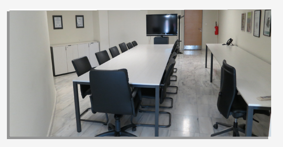
Space suitable for small meetings of 6-15 people or for the organizational needs of events and workshops